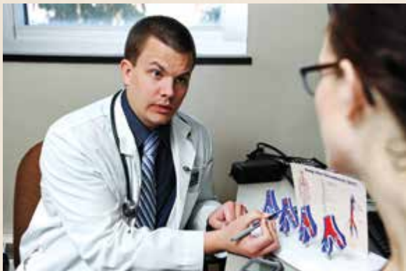
Pharmacists provide crucial roles as healthcare providers. While telepharmacy and telehealth programs bring services that enhance access to healthcare in rural communities, some reports show an increasingly urgent need for healthcare professionals in the state.